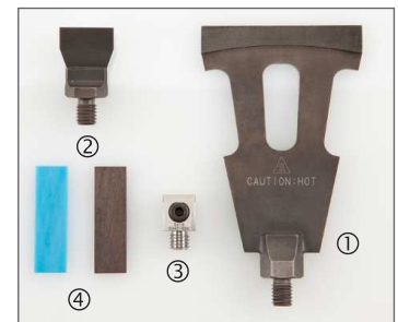
Standard and attachment tools.