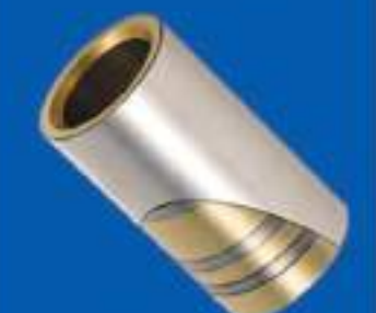
Pressed in Brass Heater