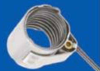
Axial Clamp Heater